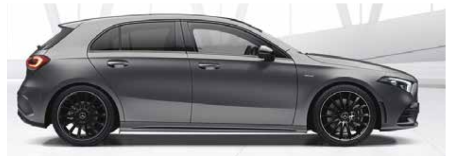
Prices from £31,305.

A choice of A-Class 'Exclusive Editions' are now available, with prices starting from £31,305 for the A200 and £34,005 for the A200d. The A250 Exclusive Edition Plus costs £37,320, while the A220d is £38,095.